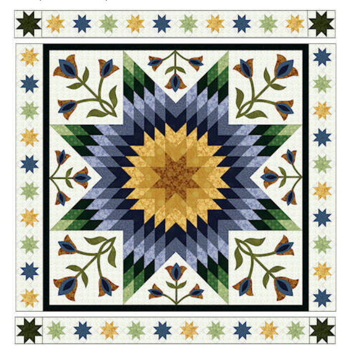
Layer, baste and quilt as desired. Bind with the remaining navy tonal fabric.

Add the border strips and corner blocks to complete the quilt.