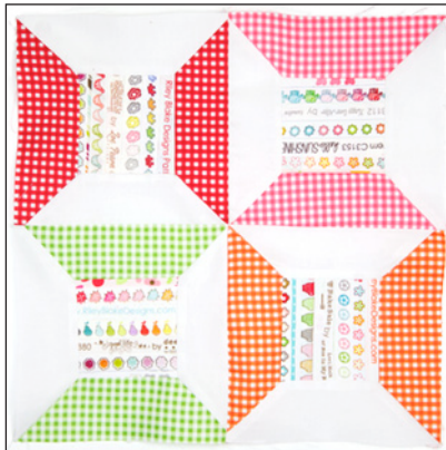
Selvage Spool Block